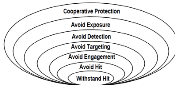
Figure 1. The Survivability Onion, re-drawn from Guzie (2004: 11).

The quantitative measure to chose depends on how the mission is defined and what should be measured. A quantitative study could give insight to mechanism linking a specific type of attack to the survivability for a specific type of ship. An insight very much needed as survivability in the general case is not only a question of having the right weapon systems or soft kill system, it can, as the NSC (NSA 2010) defines, be described in terms of susceptibility (how easily the ship can be detected), vulnerability (the inherent ability of the sip to resist damage), and recoverability (the ability of the ship to sustain operational capability). Survivability can also be described and analysed by layers of protection, the Survivability Onion, se figure 1 (Guzie 2004: 11).